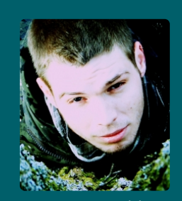
38 years old Driving License Virton (6760) Belgique